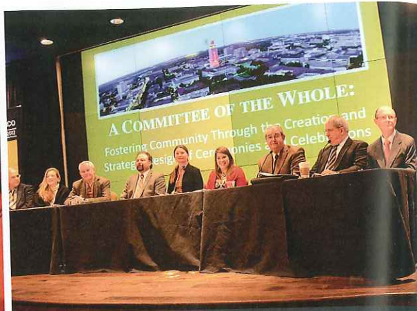
NAACO Annual Conference The North American Association of Commencement Officers held its annual conference in February in Austin, Texas. Presentations and discussions focused on how commencement, convocation and other ceremonies help define the culture of an institution.